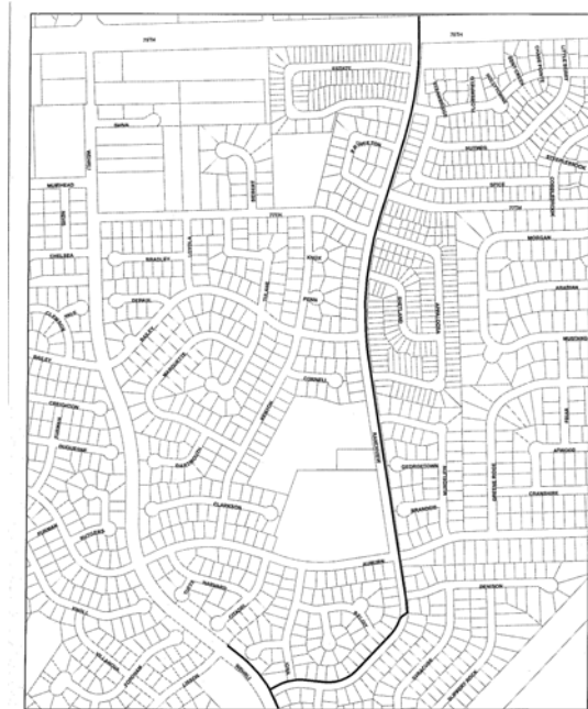
RANCHVIEW ELECTRIC DUCT BANK PROJECT SPRING 2009 — Proposed Electric Duct Bank

Construction related electrical infrastructure work is scheduled to take place on Ranchview Drive between Wehrli Road and 75 th Street beginning in late March.