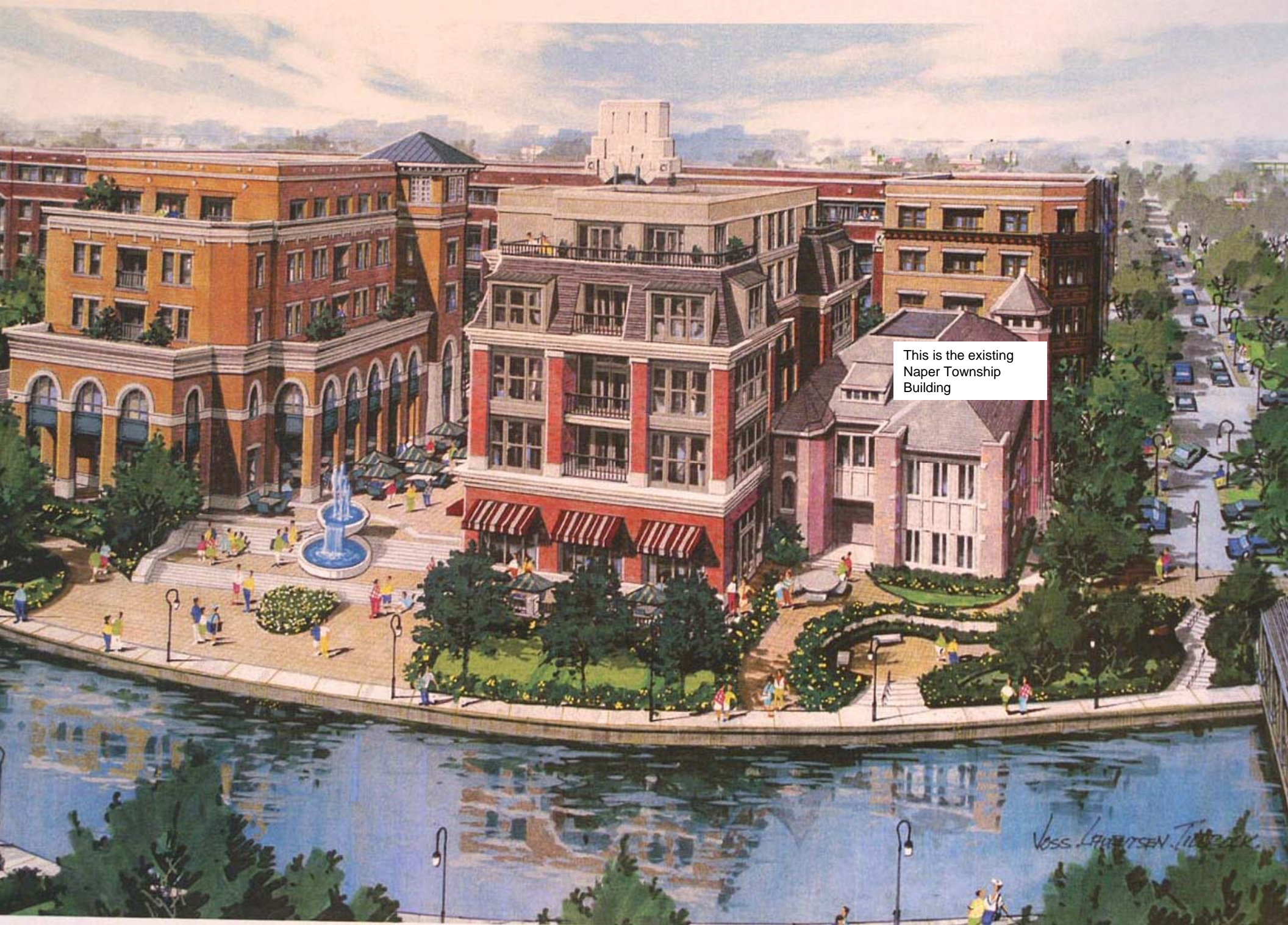
This is the existing Naper Township Building