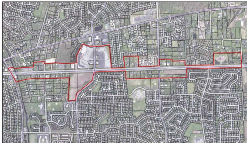
City of Naperville 75th Street Corridor Study Area

The public meeting and survey are part of the 75th Street Corridor Study, which encompasses the area located between the city's municipal boundary on the east and the intersection of 75th Street and Washington Street on the west. In addition to serving as a gateway to Naperville, 75th Street supports significant volumes of traffic and utility infrastructure. The character of the corridor varies greatly from east to west, and, although largely developed, it includes several parcels that may be subject to future development or consolidation and redevelopment activity.