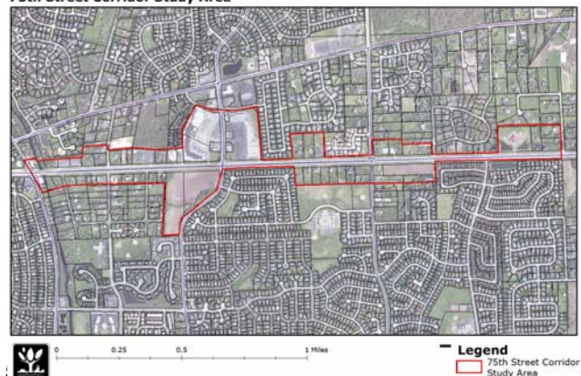
City of Naperville 75th Street Corridor Study Area

The City of Naperville is looking to the public for input on the strengths, constraints and future opportunities for the 75th Street Corridor. If you haven't made your feelings known, an online survey regarding the Corridor is available through February 4, 2008 on the city's Web site at www.naperville.il.us/75street.aspx .